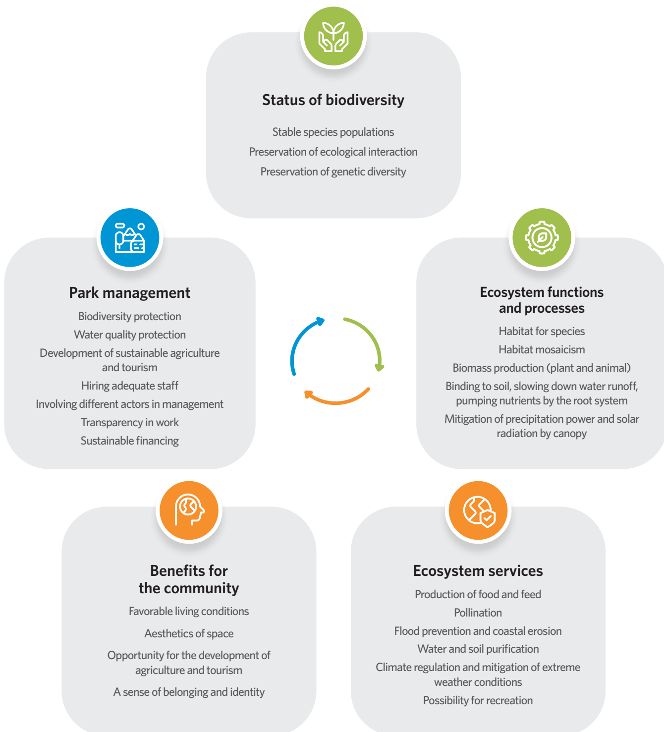
FIGURE 2 - Schematic representation of the relationship between nature, the local community, and the PA's management body. Preserved biodiversity provides ecosystem functions and processes (green) that are the basis for ecosystem services from which people benefit (orange). The resulting benefits for people and biodiversity are the basis for defining the successful management of the PA. Good management practices (blue) will enable the sustainability of this system, ensuring nature protection, good quality of life and economic development for local communities.

Preparing and implementing the best management practices for freshwater in PAs is necessary not only for the protection of biodiversity values, but also for the preservation of the ecosystem services from which local communities' benefit. Therefore, the role of the PA and its management body should be to ensure a high quality of life for people and nature in the PA, while creating opportunities for local economic development through nature protection and the sustainable use of natural resources. A PA's success, particularly for freshwater, requires support and active participation from local stakeholders who depend on the health of the ecosystem and its resources (Figure 2).